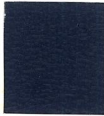
Imperial Blue 2V4