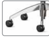
BA10B/P/S HIGH-PROFILE ALUMINUM BLACK/POLISHED/SILVER