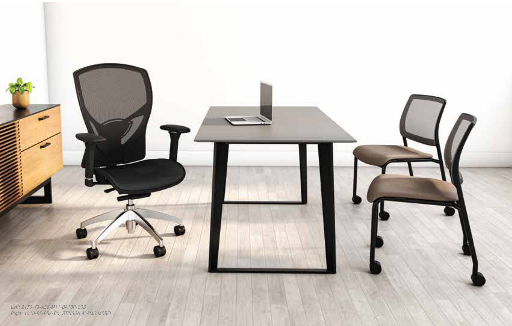
Left: 2170-Y3-A36-M11-BA10P-C6S Right: 1510-BF-PBK-C5; STINSON ALAMO MOREL