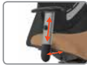
A9B/S HEIGHT/WIDTH ADJUSTABLE ARM - BLACK/SILVER