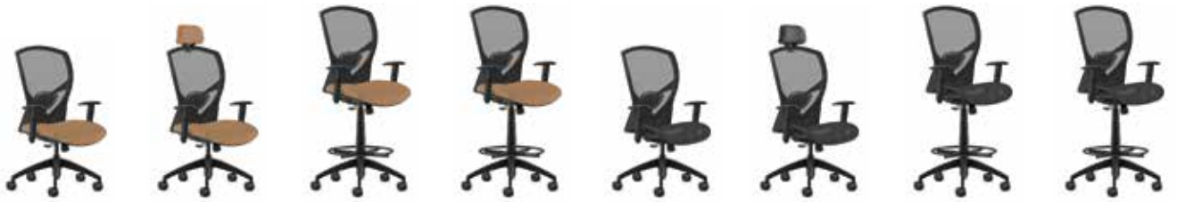
2160 US MID-BACK