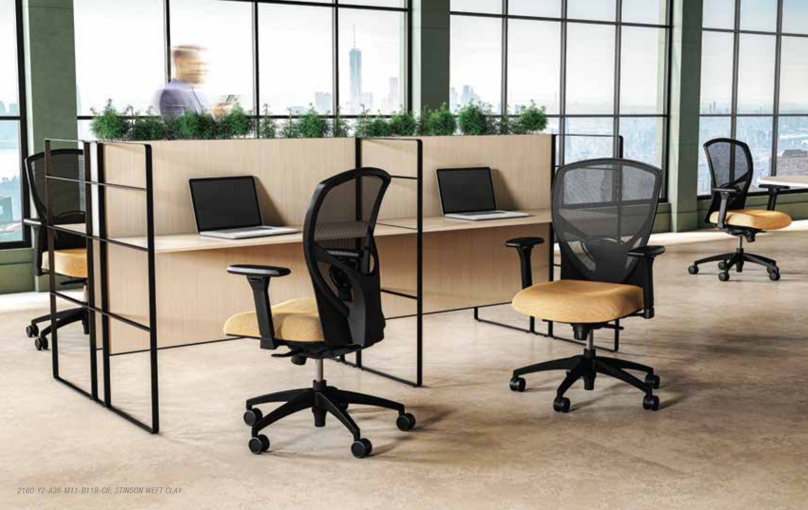
2160-Y2-A36-M11-B11B-C6; STINSON WEFT CLAY