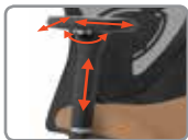
A37 HEIGHT/WIDTH ADJUSTABLE PIVOT/SLIDE ARM