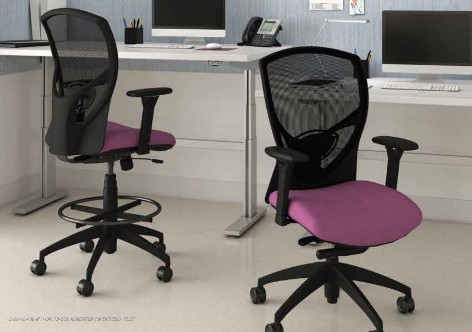
2160-Y2-A8B-M11-BA11B-C6S; MOMENTUM PARENTHESIS VIOLET