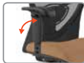
A90 HEIGHT/WIDTH ADJUSTABLE BREAKAWAY ARM