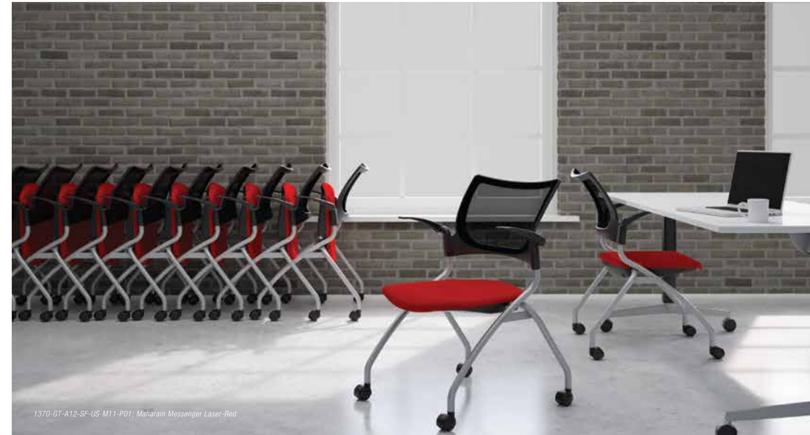
1370-GT-A12-SF-US-M11-P01, Maharam Messenger Laser-Red