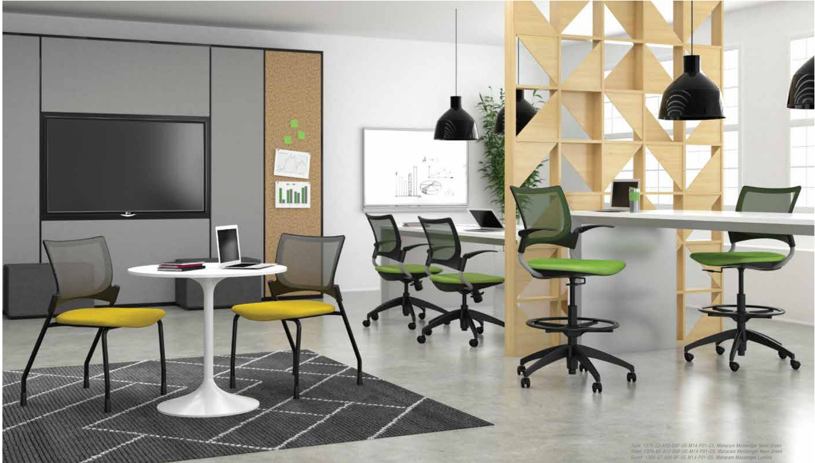
Task: 1375-S3-A12-DGF-US-M14-P01-C5, Maharam Messenger Neon Green Stool: 1376-B2-A12-DGF-US-M14-P01-C5, Maharam Messenger Neon Green Guest: 1360-GT-A00-BF-US-M14-P01-C5, Maharam Messenger Lumine

Task models are ideal for collaborative spaces, meeting rooms and other workspace areas. Arm and armless models available.