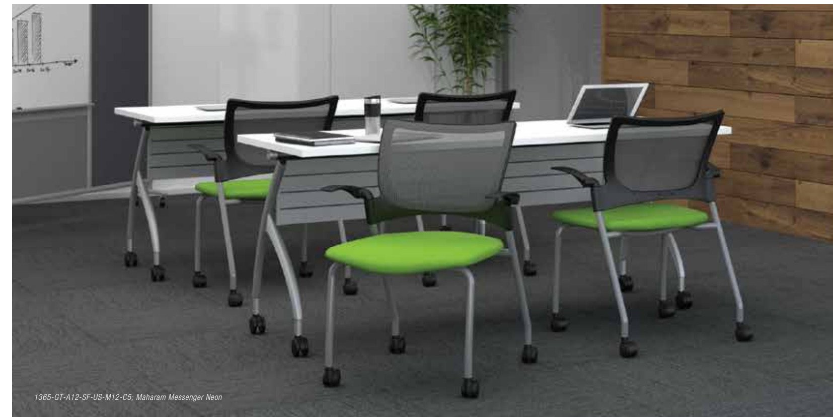
1365-GT-A12-SF-US-M12-C5, Maharam Messenger Neon

Adapt. React. Move. People are on the move, looking for new and innovative ways to get stuff done. As a result, collaborative spaces are in high demand. The Bella multi-purpose series transforms any space into a dynamic environment, capable of supporting the many ways people work. From flexible training areas, to dedicated workstation spaces, to the countless gathering opportunities in between, Bella possesses an impressive collection and design that delivers comfort and flexibility.