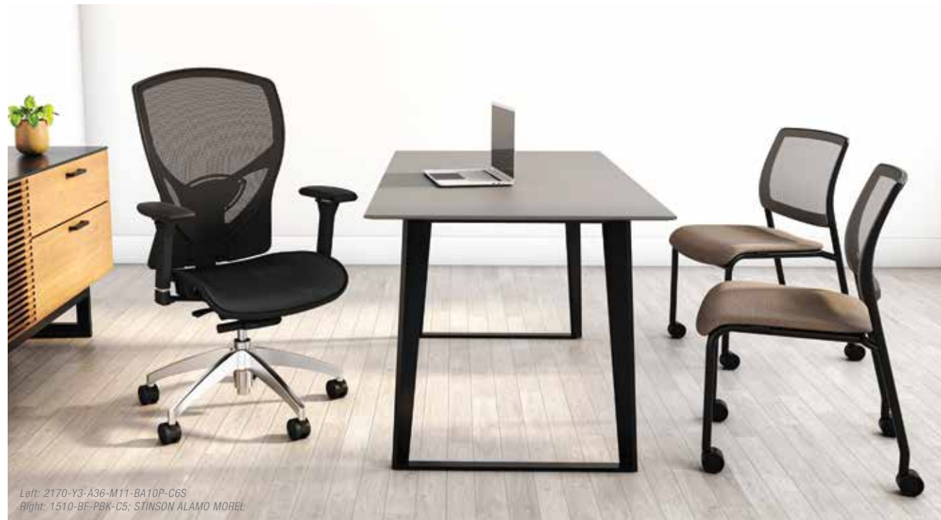
Left: 2170-Y3-A36-M11-BA10P-C6S Right: 1510-BF-PBK-C5; STINSON ALAMO MOBEL