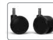
C6S LARGE DIAMETER HARD FLOOR AND CARPET CASTERS