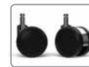
C7 CHROME-ACCENTED HARD FLOOR AND CARPET CASTERS