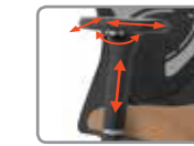
A36 HEIGHT ADJUSTABLE PIVOT/SLIDE ARM