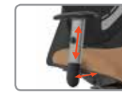
A9B/S HEIGHT/WIDTH ADJUSTABLE ARM - BLACK/SILVER