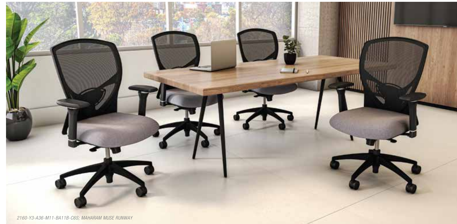
2160-Y3-A36-M11-BA11B-C6S; MAHARAM MUSE RUNWAY