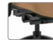
Y2 HEAVY DUTY SYNCHRO TILT