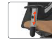
A8B/S HEIGHT ADJUSTABLE ARM BLACK/SILVER