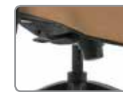
Y3 FULL SYNCHRO TILT