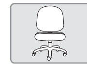
HD HEAVY DUTY MULTI-SHIFT UPGRADE 350 LB. INCLUDES BA10 AND C6S. AVAILABLE WITH Y2 ONLY.