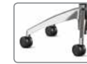
BA10B/P/S HIGH-PROFILE ALUMINUM BLACK/POLISHED/SILVER