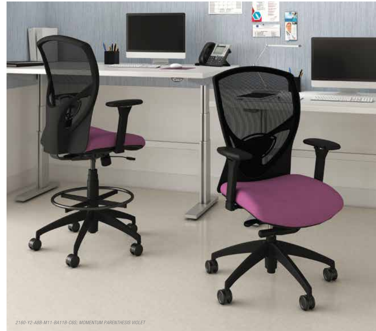
2160-Y2-A8B-M11-BA11B-C6S; MOMENTUM PARENTHESIS VIOLET