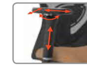
A37 HEIGHT/WIDTH ADJUSTABLE PIVOT/SLIDE ARM