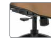
Y1 SIMPLE SYNCHRO TILT