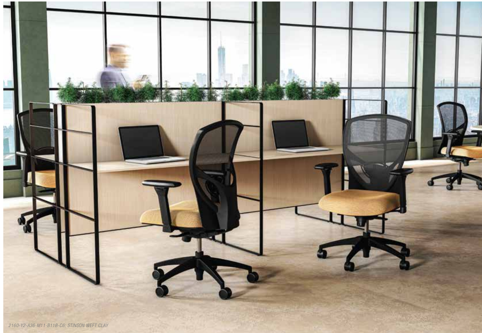
2160-Y2-A36-M11-B11B-C6; STINSON WEFT CLAY