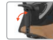
A90 HEIGHT/WIDTH ADJUSTABLE BREAKAWAY ARM