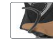
A10 SOFT TOUCH C-SHAPED ARM