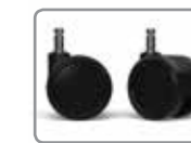
C6 LARGE DIAMETER CARPET CASTERS