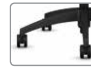
BA11B MID-PROFILE NYLON BLACK