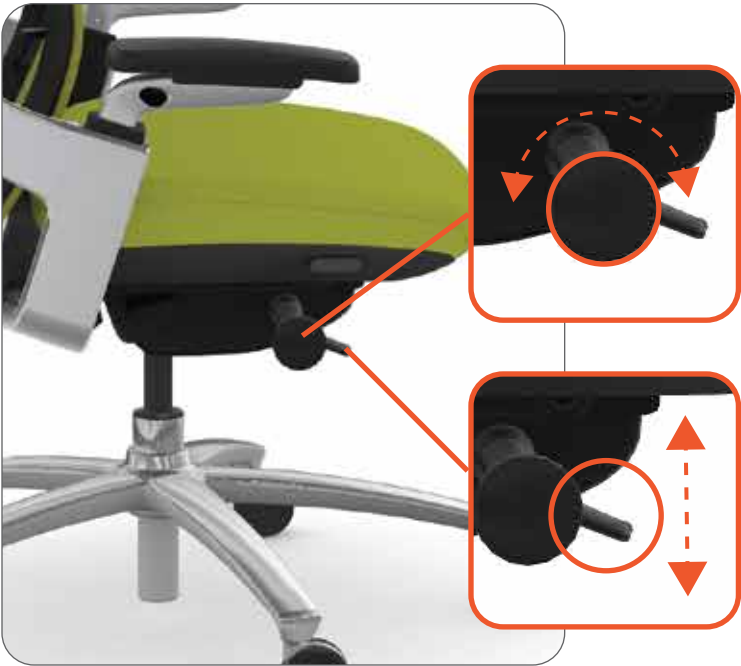
Seated Right Side (SRS)