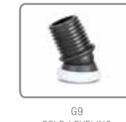
G9 SELF-LEVELING VCT GLIDE