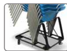
DL5 - DOLLY STACKS 10 CHAIRS (FOUR LEGS ONLY)