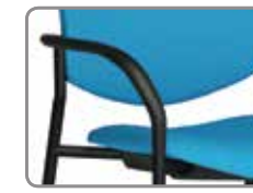
A18B SOFT TOUCH POLYURETHANE ARM BLACK