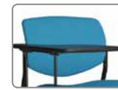
TRF RIGHT TABLET ARM