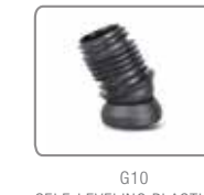
G10 SELF-LEVELING PLASTIC GLIDE WITH FELT PAD