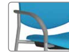
A18G SOFT TOUCH POLYURETHANE ARM GRAY