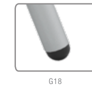
G18 DOME GLIDE