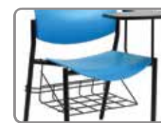
BRK BOOK RACK