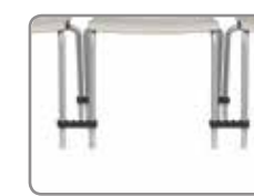
GC9 GANGLING CLIP