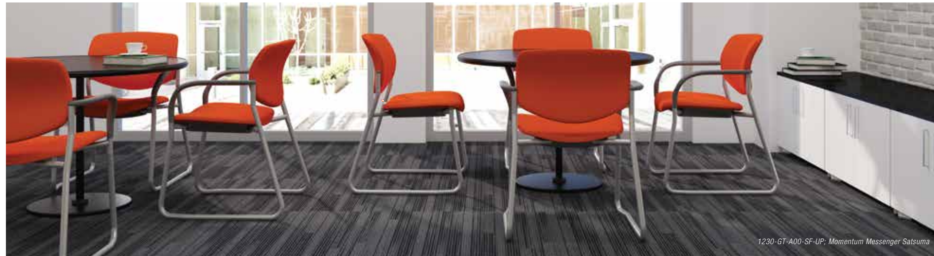
1230-GT-A00-SF-UP, Momentum Messenger Satsuma

The versatile Shuttle model provides the function, reliability and comfort required for numerous environments, making it the ultimate utility chair. Shuttle was made to work within your space with its numerous customizable features. It is offered in all plastic, upholstered or mesh back options. It comes standard with wall saver legs and non-marring floor glides in two durable powder coat finish options.