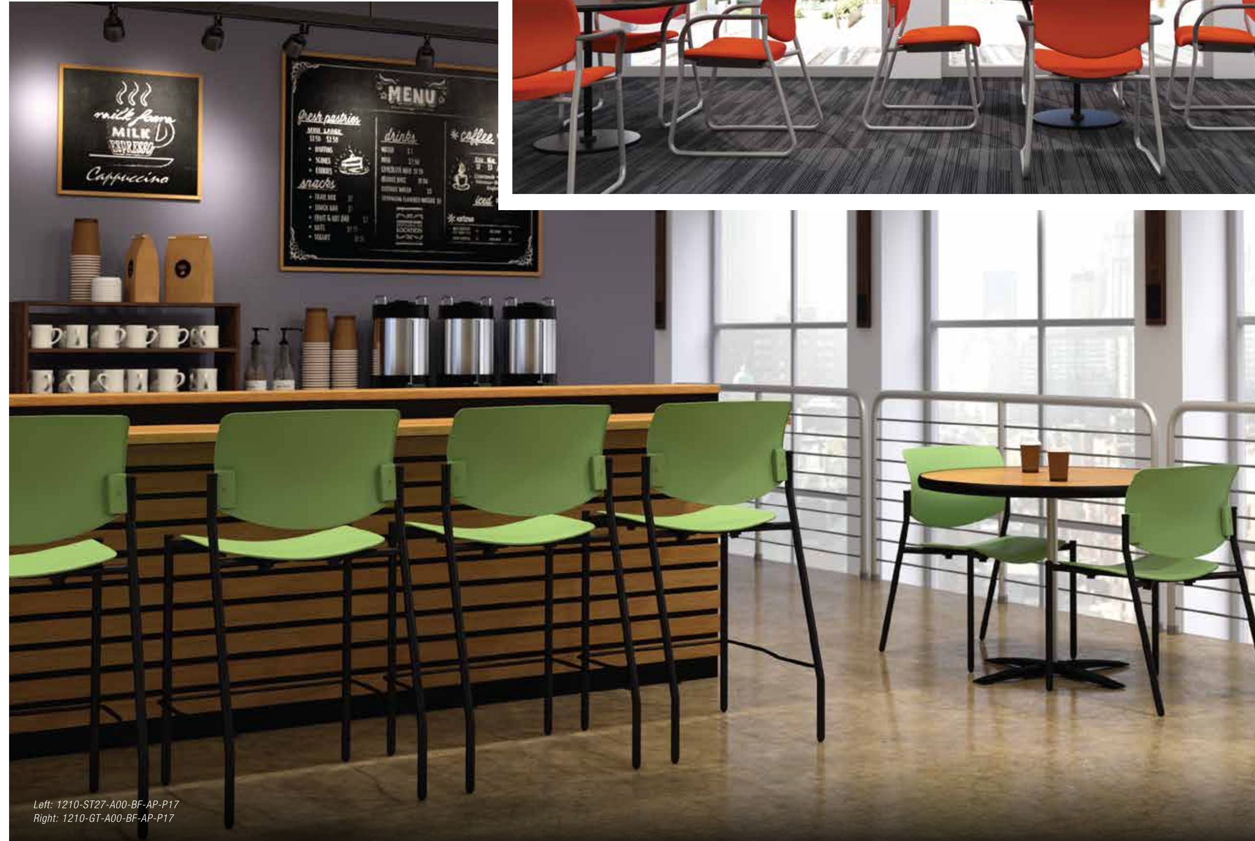
Left: 1210-ST27-A00-BF-AP-P17 Right: 1210-GT-A00-BF-AP-P17