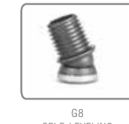
G8 SELF-LEVELING METAL GLIDE