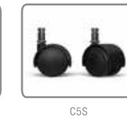
C5S HARD FLOOR AND CARPET CASTERS