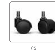
C5 CARPET CASTERS